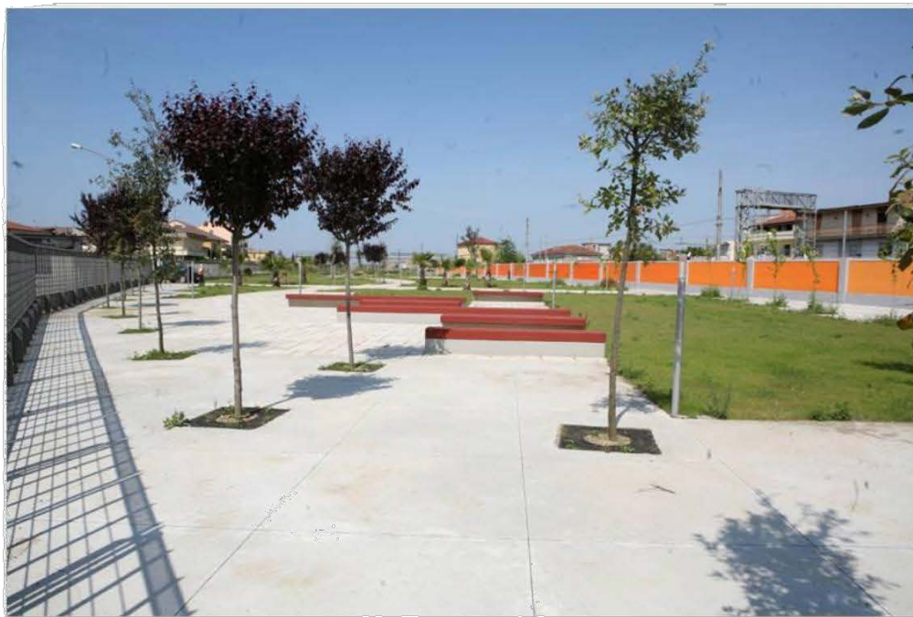
The "Park of Legality" - Casapesenna (Caserta)